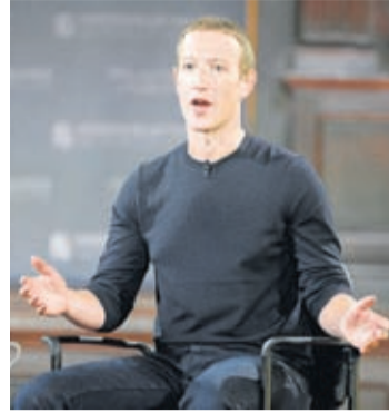
Mark Zuckerberg speaks at Georgetown University, on Oct. 17, 2019, in Washington.

Yesterday's Cryptoquote: YOU CAN TELL A LOT ABOUT A PERSON BY THE WAY (S)HE HANDLES THREE THINGS: A RAINY DAY, LOST LUGGAGE, AND TANGLED CHRISTMAS TREE LIGHTS. — MAYA ANGELOU